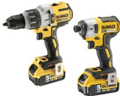
Combi Twin Pack