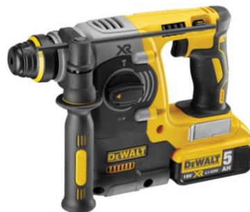
SDS Hammer Drill