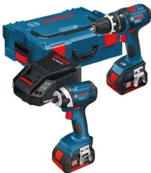
Combi Twin Pack