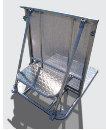
1m barrier unit