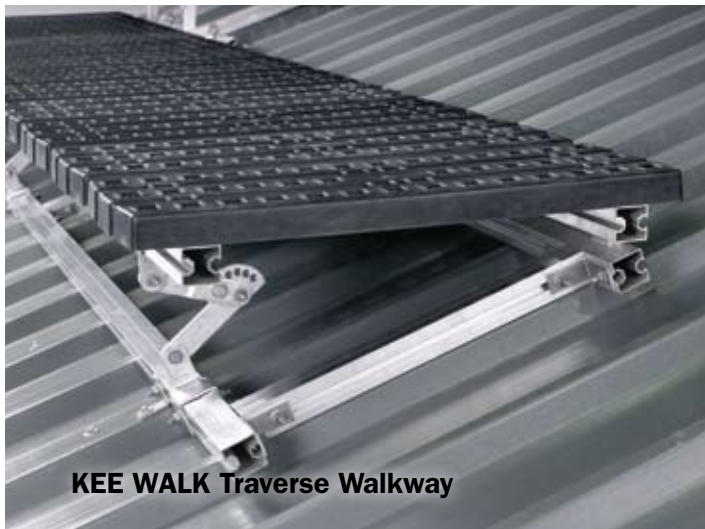
KEE WALK Traverse Walkway

Supplied pre-assembled by Kee Safety to facilitate rapid on-site installation and thus minimise installation costs, these standard lengths have 12 treads per 3m. Weighing only 24kg, the standard lengths are easily positioned and aligned. They are joined together by a simple 100mm long straight connector which attaches to the bearer bars.