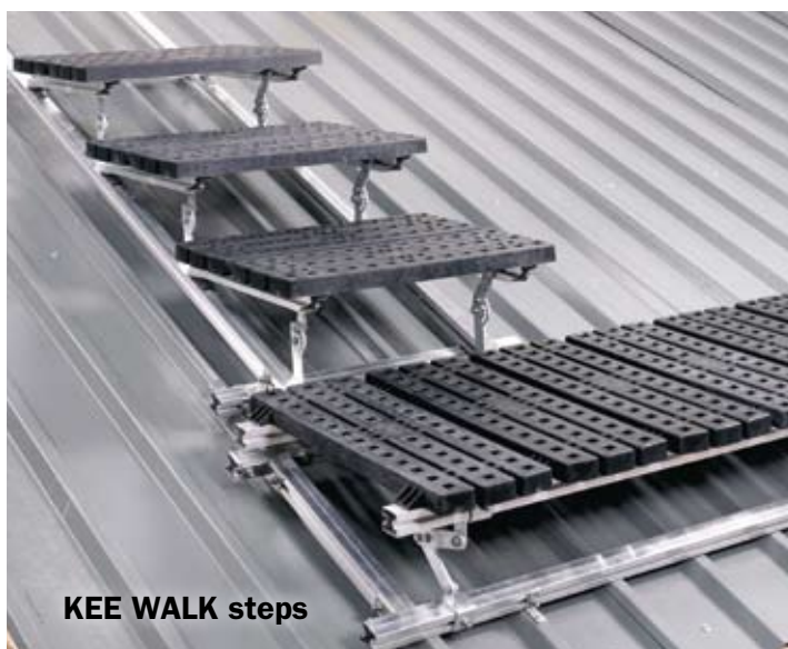
KEE WALK steps

Kee Safety provides pre-assembled step configurations in 3m or 1.5m lengths which require only minor adjustment on-site. The rotating arms (shown above) allow the installer to set the angle of the steps simply by removing the locating bolt, setting the horizontal angle and then replacing the bolt. The steps configurations will change depending on the pitch of the roof. Standard components are available for 5° - 10°, 10° - 15°, 15° - 25°, 25° - 35°, all which comply with the requirements of EN 516. Kee Safety can provide specific information on all the different step configurations as required.